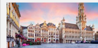
Located in Brussels, Belgium with access to the best of the city

The conference is conveniently located in Central Brussels—steps away from the Gare Centrale and may of the top attractions in the city, including: Galeries Royales Saint-Hubert featuring shopping, cafés and a theatre; Place du Grand Sablon, one of the oldest neighborhoods of Brussels with two lovely squares, a neo-gothic church and many old streets and houses with art galleries, pastry shops, cafés, and a weekend antiques market; and Rue Antoine Dansaert, home to fine jewellers and edgy European fashion boutiques.