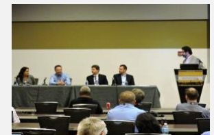
The comprehensive, two-day agenda features 40 speakers

File Submission Instructions: Email preferred. Send to bill@cnxtd.com. Files received will be confirmed. To mail, send memory device to Cnxted Event Media Services, 421 Seventh Ave. #1012, New York, NY 10001. To FTP: We recommend Hightail, a free online FTP service. Visit www.hightail.com for instructions. For assistance call 212-866-2169.