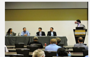
The comprehensive, two-day agenda features 40 speakers